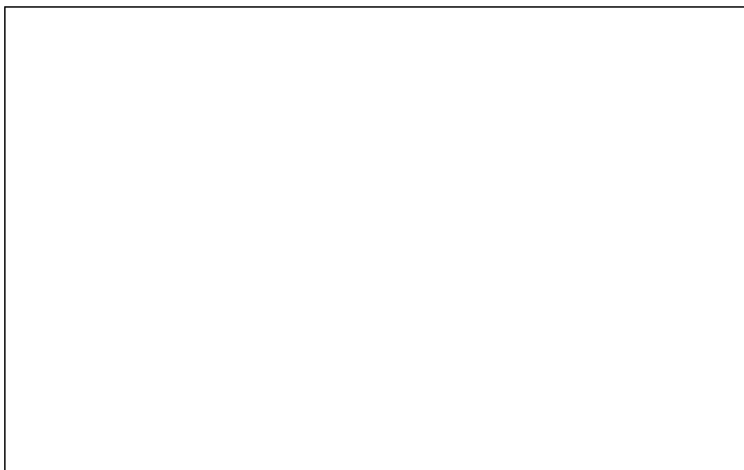
Shanti Bahini members officially handing in their arms, 1998 © Philip Gain.

Under the accord, about 2,000 PCJSS fighters surrendered their arms to the government by 5 March 1998 and the Shanti Bahini was considered to have been disbanded. Most criminal cases against former Shanti Bahini members on grounds of armed political activity including “waging war against Bangladesh” were dropped as provided for by the accord. The government’s position with regard to several of such cases which are still pending has remained